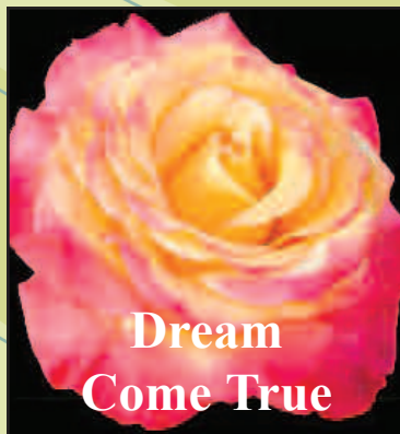
Dream Come True