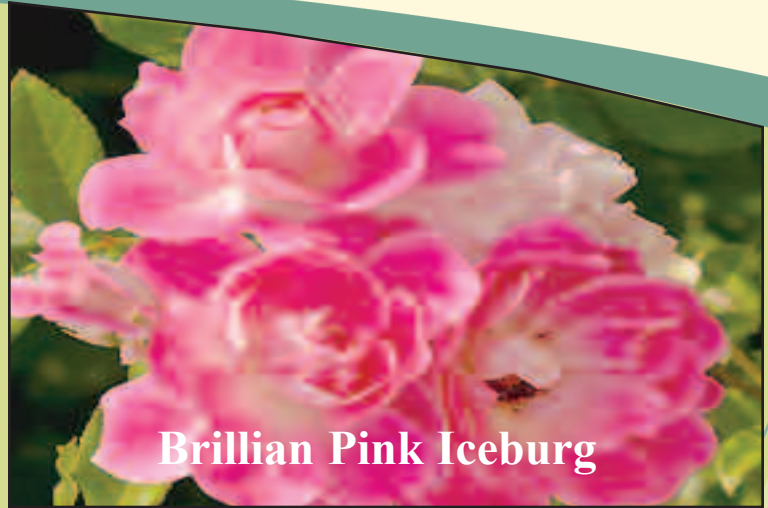
Brilliant Pink Iceburg