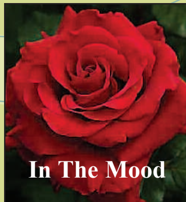
In The Mood